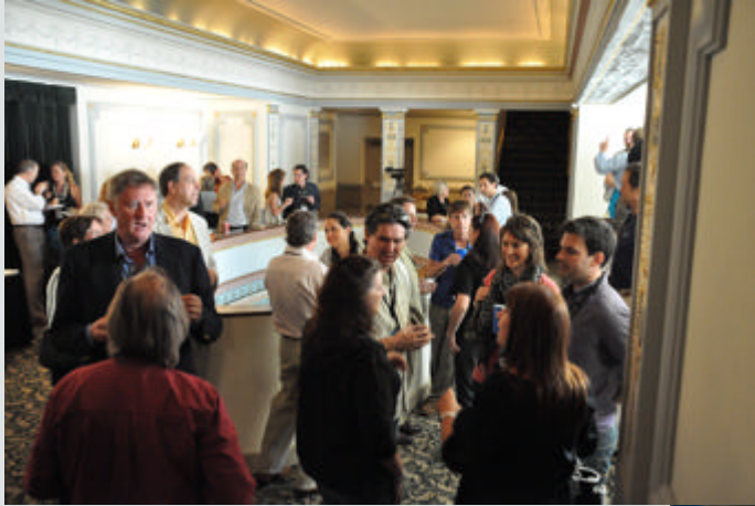
Pre Awards Film Finalists Recept